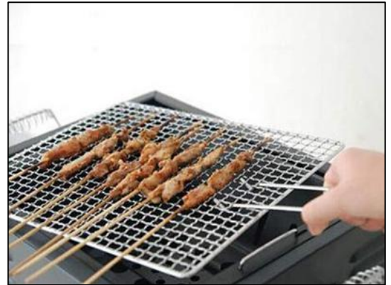
Crimped barbecue wire mesh

Crimped wire mesh and expanded metal are perfect for producing barbecue grill, those kinds barbecue mesh are widely used for barbecue restaurants, picnic, camping, travel and other activities.