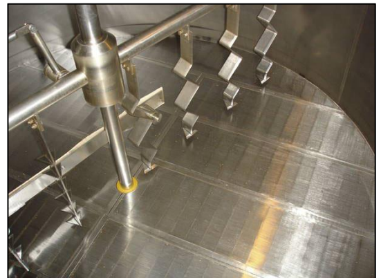
Wedge screen panel in lautering tuns

Woven wire mesh and wedge wire screen are used in malting, lautering, final beer filtration, and water treatment process stages in the brewing industry.