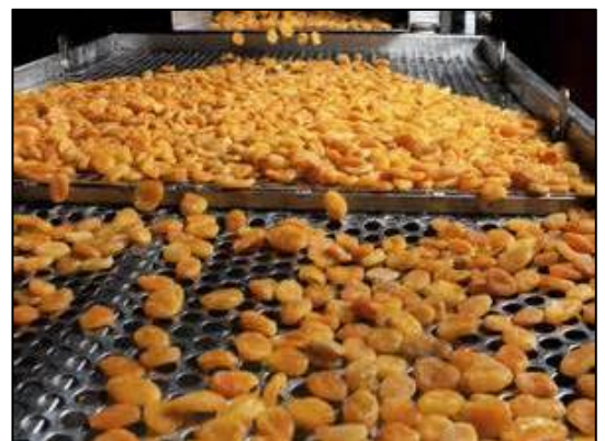
Perforated metal for baking

The filter mesh and filter elements used for sugar filtration to remove harmful contamination and to ensure maximum product quality at all times.