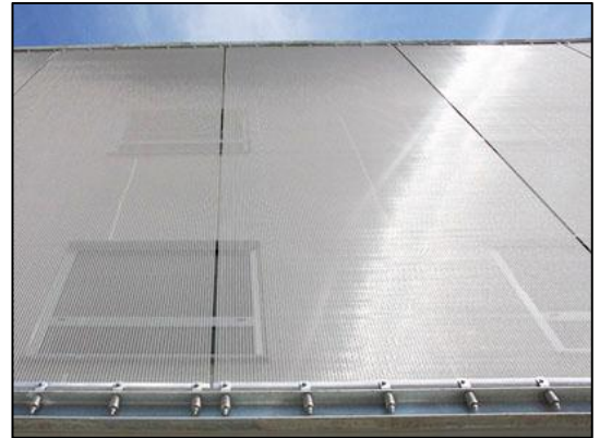
Cable & rod mesh facade