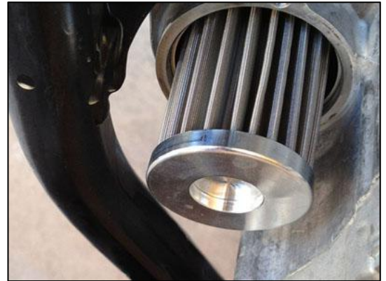
Woven mesh oil filters

Car grille is often found on high-speed vehicles, it also allows maximum airflow while giving ultimate protection to your radiator, engine, and air intake of a vehicle from debris, collisions, and other accidents etc.