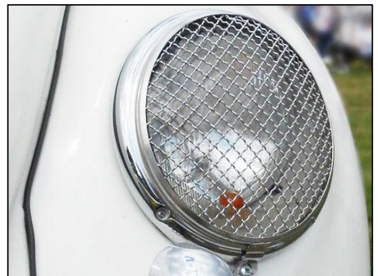
Crimped mesh headlight stone guards