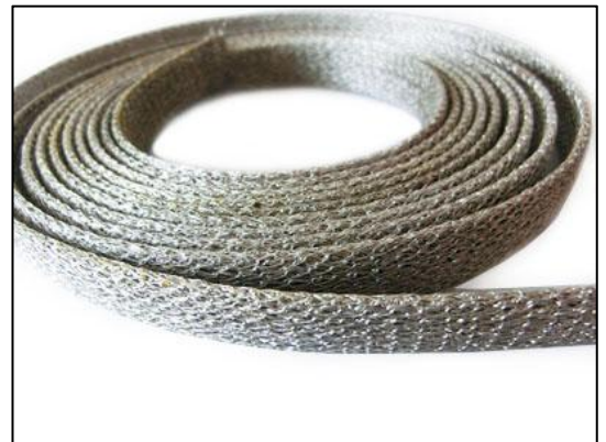
Knitted mesh for mufflers & silencers