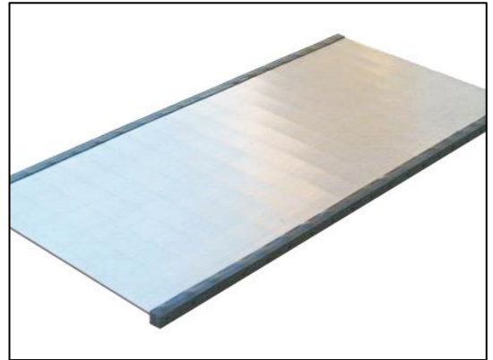
Screen panel with polyurethane edge

Centrifuge baskets are used in coal and mineral industries for dewatering applications and are designed to withstand the high vibrating and rotational stresses of centrifugal dryer systems. Each basket is dynamically balanced to a very high standard to prevent secondary vibration inducing premature fatigue failure.