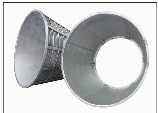
Wedge wire screen centrifuge baskets