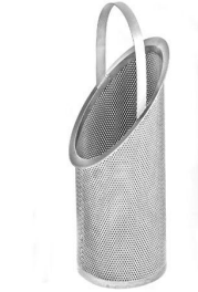
Slanted Top, Flat Bottom