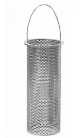
Flat Top, Flat Bottom