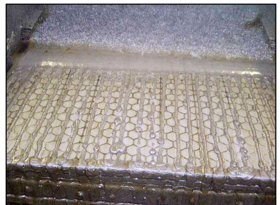
Shaker screen for drilling mud