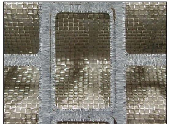
Wave shale shaker screen