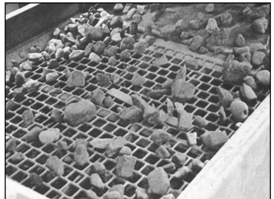
Perforated metal mining screen