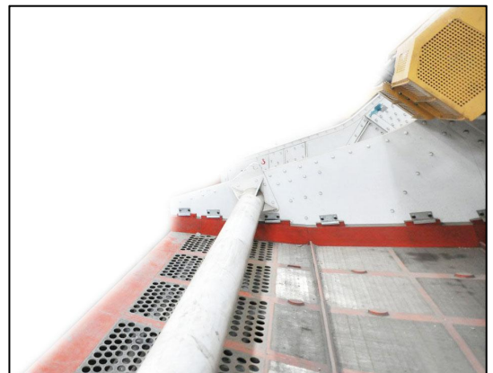
Wedge wire screen for coal