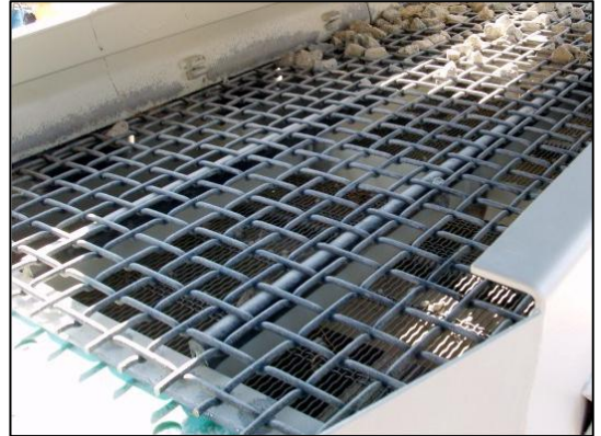
Crimped mesh vibrating screen